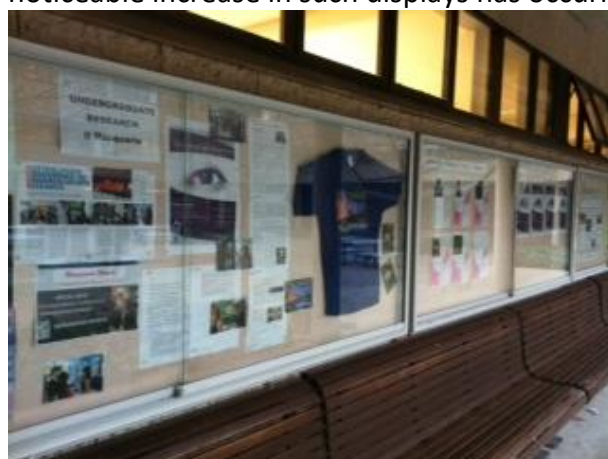
Figure 2. Display of undergraduate research in C5C courtyard

The Priority Grant project had investigated how research in general and undergraduate research in particular was displayed across campus. These investigations resulted in obtaining access to the display cabinets in C5C courtyard. On behalf of ACUR we therefore took over responsibility for displays. Information including undergraduate research opportunities, events, and sharing of networks including MUURSS (Macquarie University Undergraduate Research Student Society) posters has regularly been displayed throughout 2013. Working Group members were encouraged to display posters of students work in their departments and a noticeable increase in such displays has occurred.