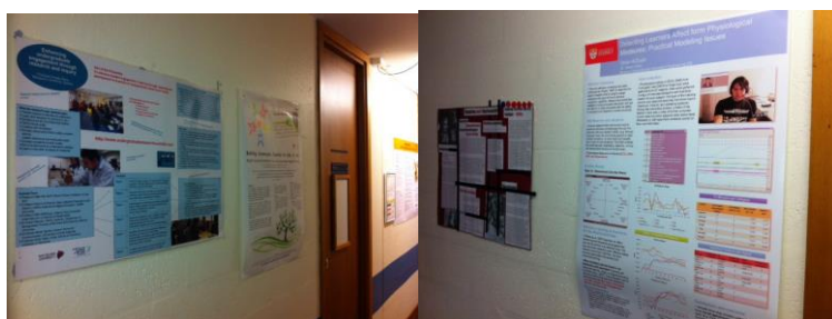
Figure 3. Corridor displays of undergraduate research posters