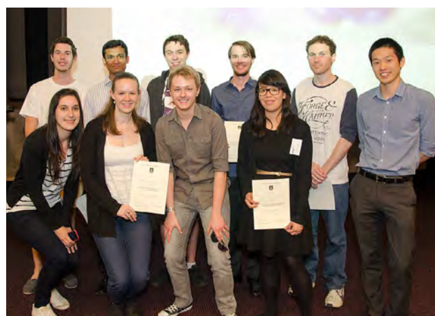
Some of the prize-winners at ACUR 2013